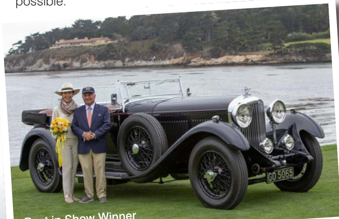
Best in Show Winner