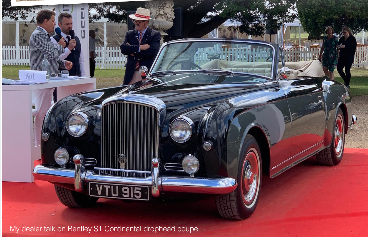
My dealer talk on Bentley S1 Continental drophead coupe