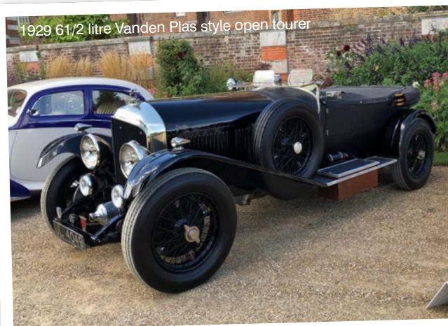
1929 6 1/2 litre Vanden Plas style open tourer

I wouldn't fancy keeping it clean though.