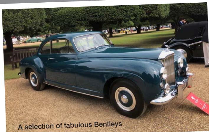
A selection of fabulous Bentleys

The end of August and the start of September sees the end of the summer holidays in Europe and a mad crush of the final motoring events in the UK before the weather fades and the days become shorter. And 2019 with the Bentley anniversary saw this usually busy period for us reach a whole new level, with three events over the same weekend.