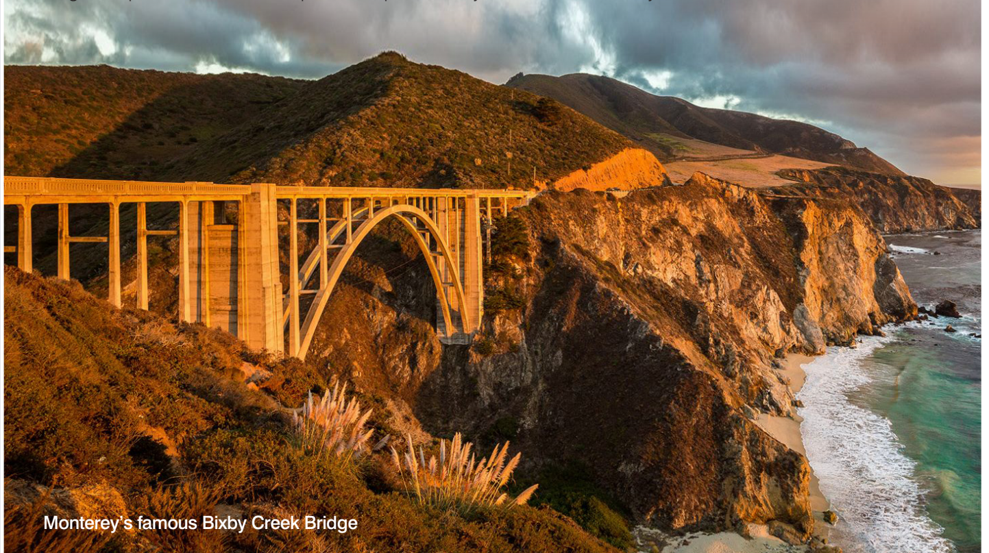
Monterey's famous Bixby Creek Bridge