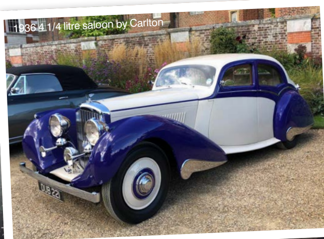
1936 4 1/4 litre saloon by Carlton