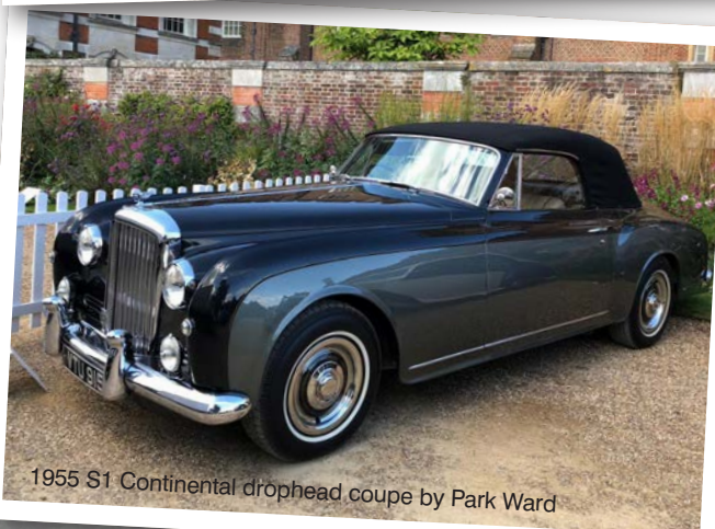
1955 S1 Continental drophead coupe by Park Ward