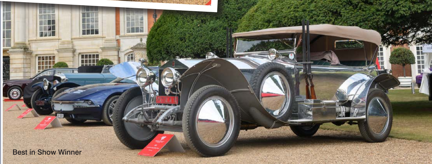
Best in Show Winner